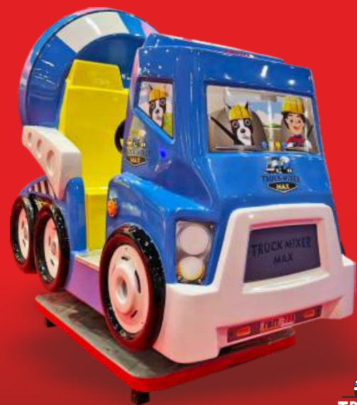
TRUCK MIXER MAX