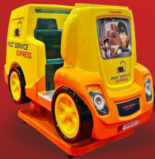
POST SERVICE EXPRESS